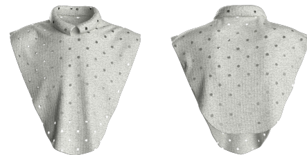
Fine knit mohair bib with perforated stitch detail