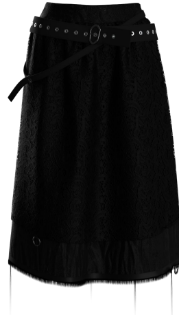
Silk satin and vintage lace tiered skirt with ring appliques and frayed edging