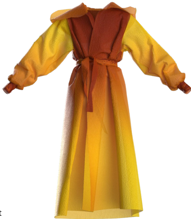
Oversized hooded raincoat in sheer vinyl with hand painted AI gradient embellishment