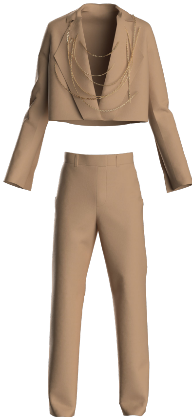
Cropped bolero suit jacket adorned with gold strewn chains

Top: Mohair fine knit bib with rolled short collar and perforated stitch pattern.