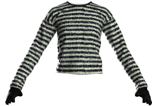
Brushed angora sweater Leather glove accessories