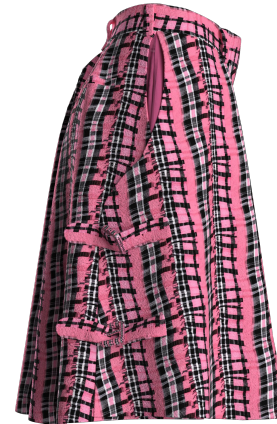
Culottes with hand drawn AI check print and acetate side buckles