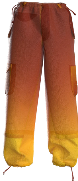
Parachute Trousers in sheer vinyl with utility pockets with hand painted AI gradient embellishment