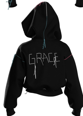
Hoodie with AI monster print and stitch applique