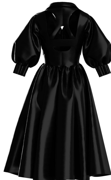
Open back panels and under arm air vents