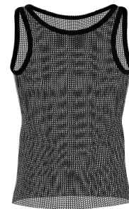
Mesh fishnet vest