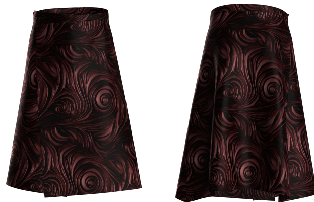
Hand painted silk apron with AI leather rosette print