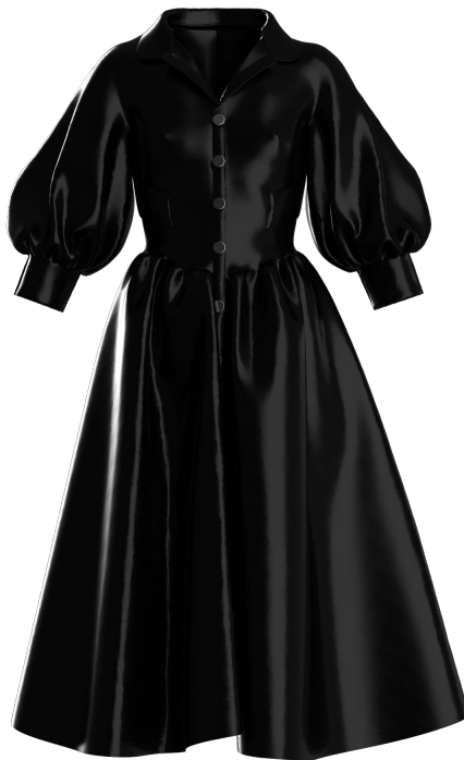
High gloss latex dress with pencil tuck cuff detail

Dress: Latex flared dress with velocity air vents in sleeve and open paneling on the back. Front shirt button detail with voluminous sleeves and cuff pencil tuck detail. Side slit for fast and agile movements.