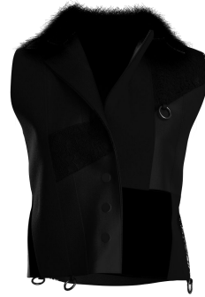
Fitted gilet jacket with patchwork panels, leather strapping, buckles and ring appliques

Accessories: Leather fingerless gloves with multi buckle detail. Leather studded multi belts.